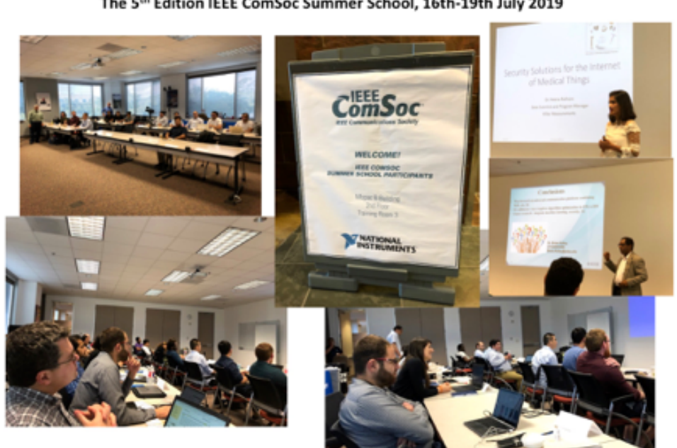
The 5th Edition IEEE ComSoc Summer School, 16th-19th July 2019